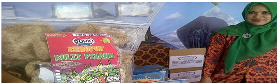
Figure 3. One of SME products of Belitung Regency, banana peel chips.

It Cannot be denied by the increasingly sophisticated technological developments as nowadays have enormous effects in all fields. And this also has its own positive and negative, with the internet now we can buy what we want, only through the smartphone we can shop anything according to our needs. With the online market is expected to expand the scope of marketing products of SMEs in the marketing of their products and certainly expected to increase the welfare of the community of SMEs in marketing their products to a higher stage with a wide marketing coverage is not limited to the region, city, or country. And motivate them to create superior products that will compete in the global market. The success and failure of tourism business development involving SMEs in Belitung Regency are dependent on the quality of human resources owned and all components such as stakeholders or local government as policymakers should also participate to encourage, assist and support the development of tourism business involving SMEs to run and able to prosper society (Figure 3).